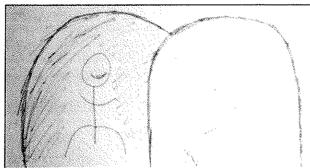
Figure 1 Inside/outside of feelings box by a 13-year-old

guage; therefore, we have fewer established defense patterns (Waller, 1992). Thus, art therapy interventions have the capacity to slip under the normal radar of resistance.